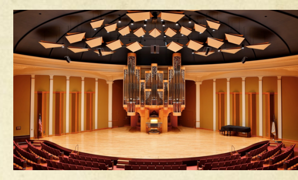
Gray Chapel, an outstanding concert hall on campus at OWU