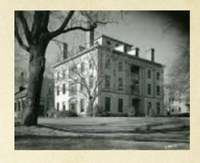
Elliott Hall - then and now

By the end of the 19th century, Ohio Wesleyan had added a School of Music (1877), School of Fine Arts (1877), School of Oratory (1894), and Business School (1895) to the original College of Liberal Arts (founded in 1844).<sup>[</sup>