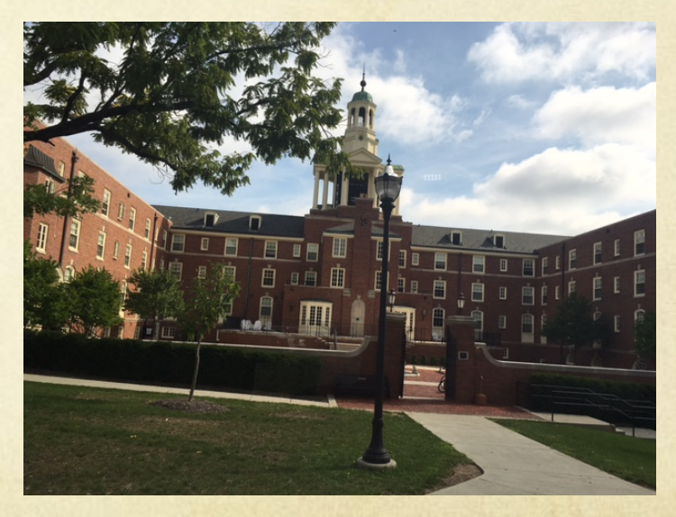
Stuyvesant Hall was built in 1930 and recently renovated.