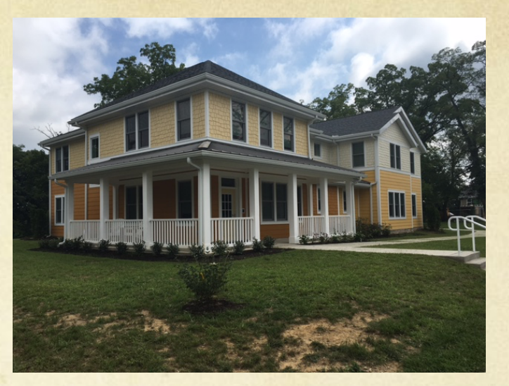
A Small Living Unit (SLU)

There is a 4 year live-on-campus requirement for students unless they live at home and commute no more than 30 miles. OWU offers students a variety of housing choices including 7 residence halls (suite style and dormitory options), 7 SLUs, and 4 themed houses. SLUs (small living units) house 10-16 students in a small house. These are often organized around themes such as, "Interfaith," "Peace and Justice," "Gender Equality," and others. In terms of dining, there are 2 cafeteria-style dining halls as well as 4 cafes and a convenience store.