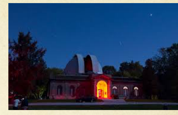
OWU's Perkins Observatory