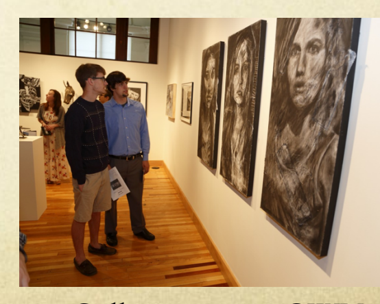
Gallery space at OWU