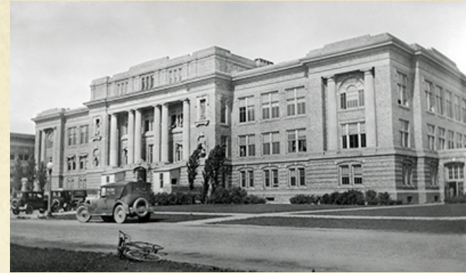
University Hall, originally constructed in 1915 is currently undergoing renovation.

Beginning in 1946, extension programs of the university were offered in Sandusky, Ohio and later at other locations. In the 1970s, three new colleges were added to the University's curricular offerings. In 1973, the College of Health and Human Services was established to provide degree programs in specialized areas in various health and community service fields. In 1975, the School of Music was expanded into the College of Musical Arts, and in the same year the Graduate School became the Graduate College. The School of Technology was granted college status in 1985.