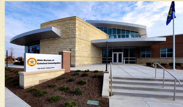
Ohio Bureau of Criminal Investigation Lab