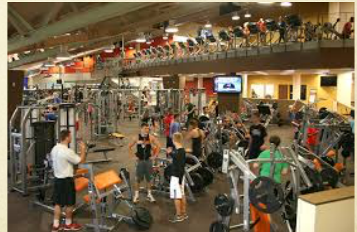
BGSU Recreation Center