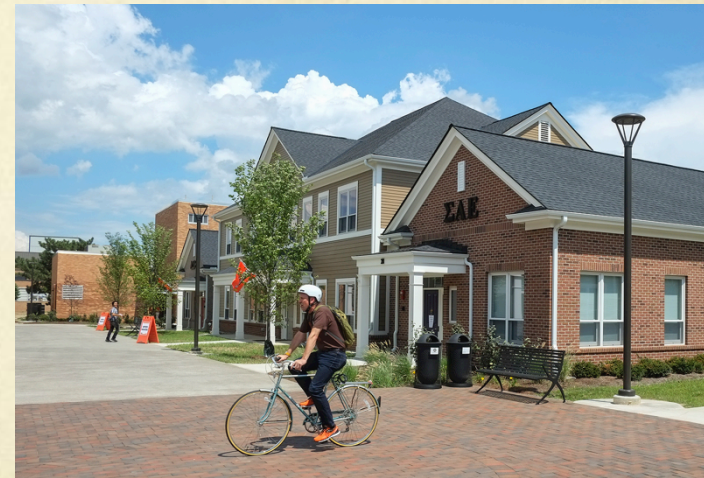
The new Greek Village