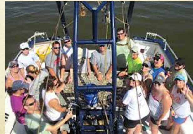
Gulf Coast Research Lab