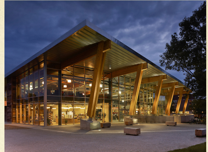
The Oaks Dining Facility

BGSU offers students four recreational facilities including a golf course, ice arena, and newly renovated recreation center.