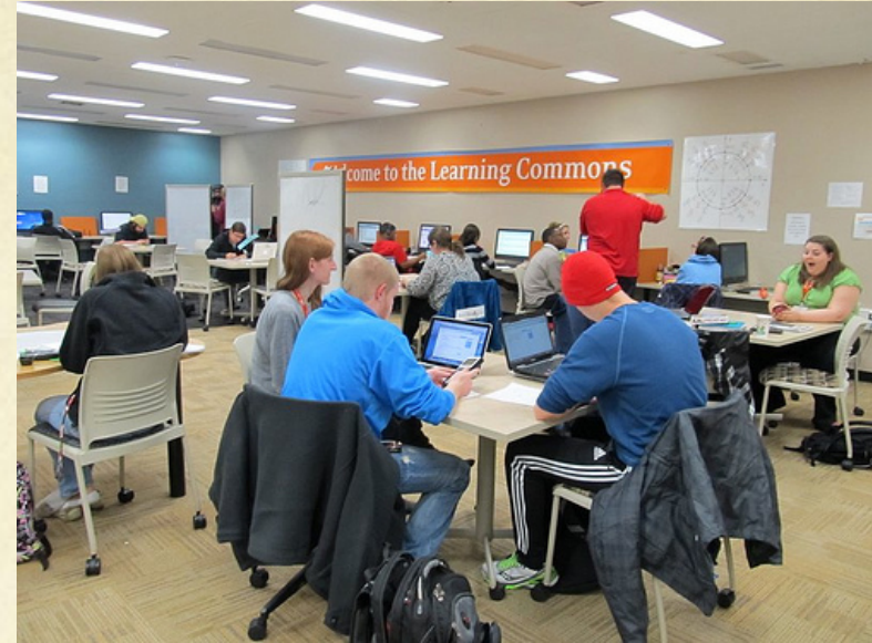
The Learning Commons

Additionally, BGSU is one of only a few institutions in Ohio that offer an intensive, individualized academic support program for students with learning challenges including ADD and ADHD. Their new “ FLY Program ” (Falcon Learning Your Way) matches students to a full-time learning specialist, assigned tutor, and a writing consultant for each enrolled course. An Academic Coach is also assigned to help students improve time management skills and study strategies. The FLY Program is a specialized service offered for an additional charge of $2,500 per semester.