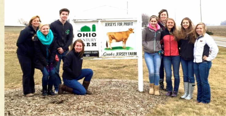
An outing for the Student Nutrition Association