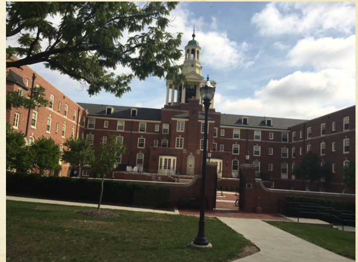
Stuyvesant Hall was built in 1930 and recently renovated.