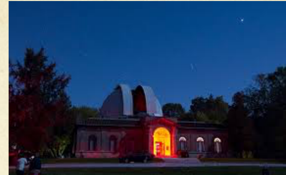
OWU's Perkins Observatory