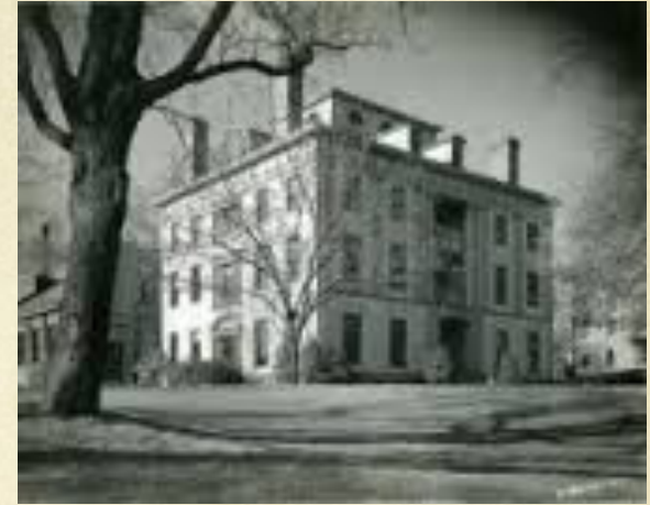
Elliott Hall - then and now

By the end of the 19th century, Ohio Wesleyan had added a School of Music (1877), School of Fine Arts (1877), School of Oratory (1894), and Business School (1895) to the original College of Liberal Arts (founded in 1844). 1