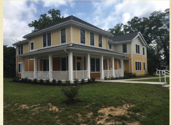
A Small Living Unit (SLU)

There is a 4 year live-on-campus requirement for students unless they live at home and commute no more than 30 miles. OWU offers students a variety of housing choices including 7 residence halls (suite style and dormitory options), 7 SLUs, and 4 themed houses. SLUs (small living units) house 10-16 students in a small house. These are often organized around themes such as, “Interfaith,” “Peace and Justice,” “Gender Equality,” and others. In terms of dining, there are 2 cafeteria-style dining halls as well as 4 cafes and a convenience store.