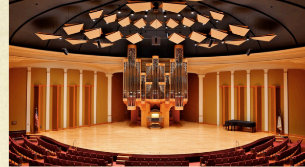
Gray Chapel, an outstanding concert hall on campus at OWU