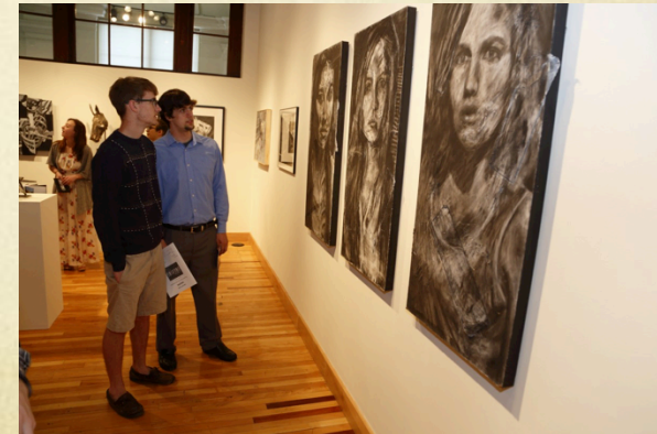
Gallery space at OWU