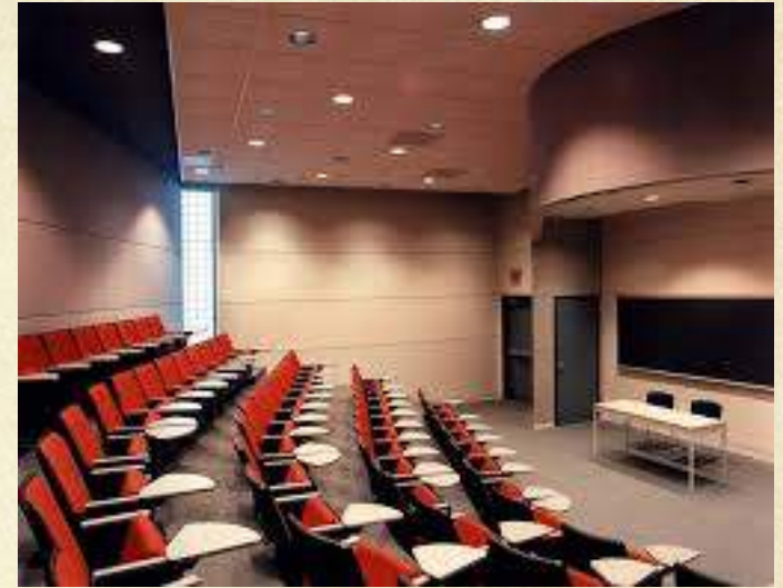
A large, lecture classroom at UA