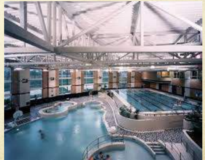
Student Recreation and Wellness Center