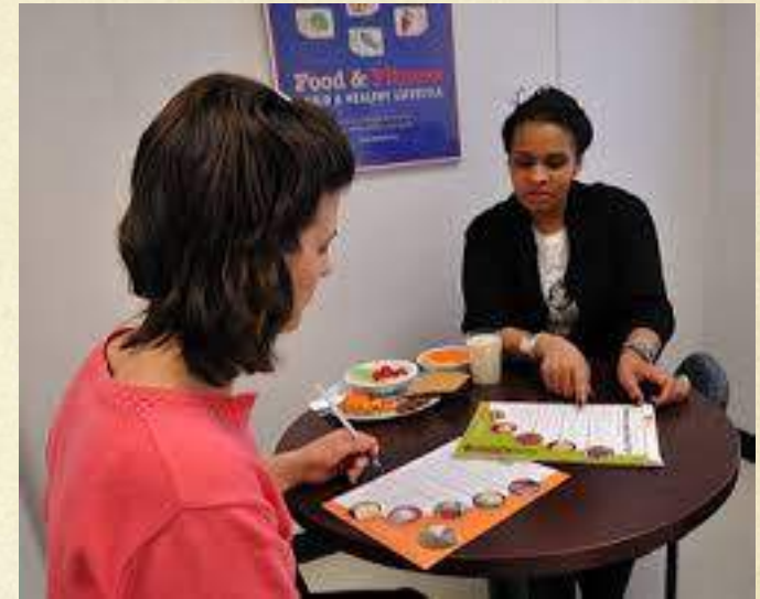
UA Nutrition Center