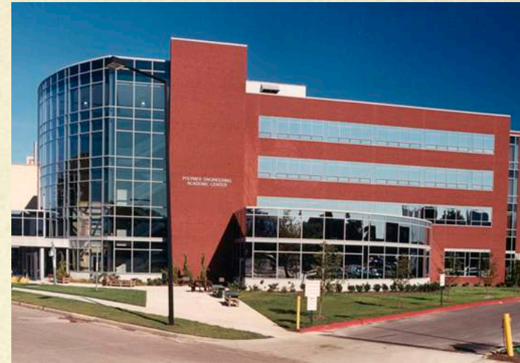
Polymer Engineering Academic Center