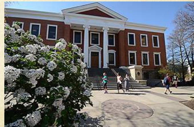
Buchtel Common today