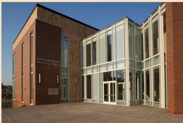
Muskingum University PLUS Program Offices in Walter Hall

Parents of college students with learning differences such as ADD, ADHD, or even light autism often find the traditional set of learning support services at most colleges to be insufficient to respond to their son or daughter's needs. All colleges provide "disability services" including a variety of accommodations such as extended test taking time and distraction free environments. They also provide traditional learning supports including peer tutoring, study skills classes, and early intervention systems. However, few students take full advantage of these opportunities and many need support beyond that provided.